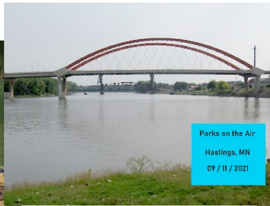
Parks on the Air Hastings, MN 09 / 11 / 2021