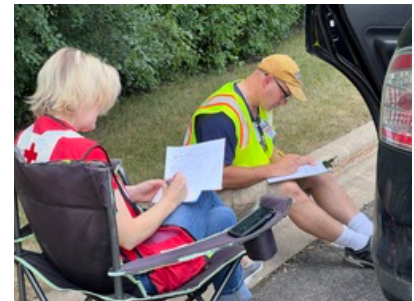
A Red Cross volunteer with an ARES communicator in the field.