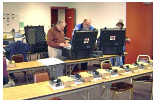
SEMARC Meeting Program (Work Party)

SEMARC supports the WØCGM repeater on 146.985 (with negative offset and no tone) for nets and other short range communications. Repeater can be internet linked for Echolink or VoIP. See the club website for details.