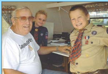
Jamboree on the Air