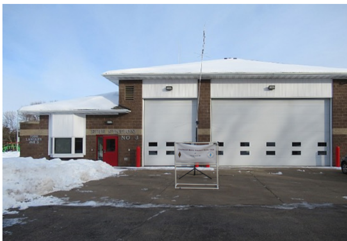
Cottage Grove Fire Station #3